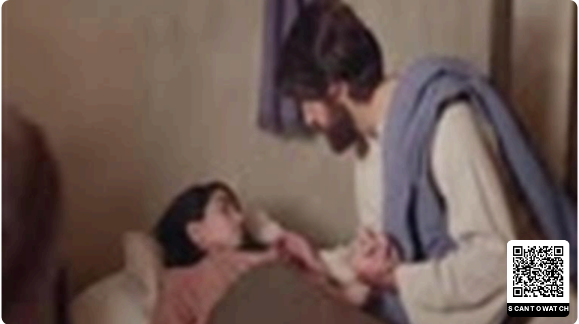
Hope for Dead Loved Ones